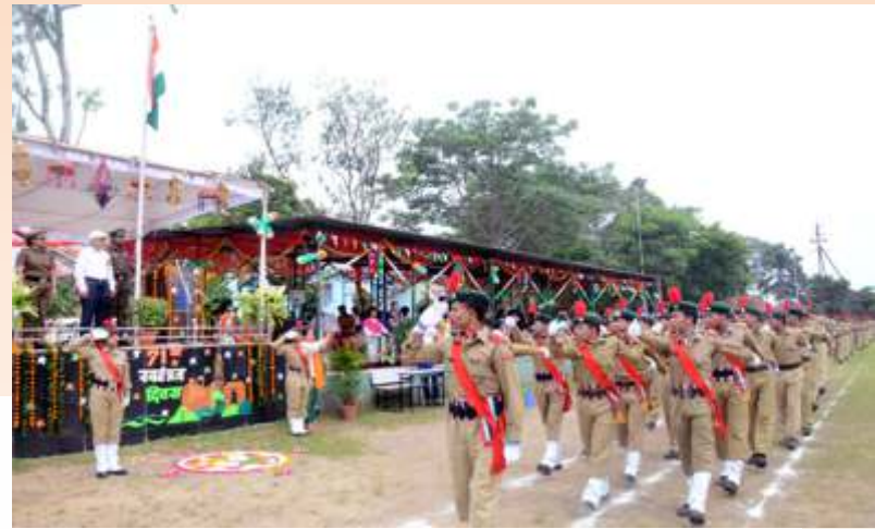
NCC and NSS Performing an excellent march past cadets