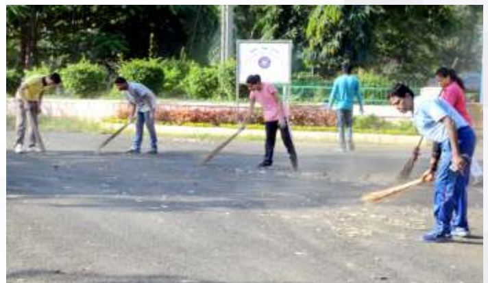
Swachh Bharat Abhiyan Mission followed by RIE faculty members and Students