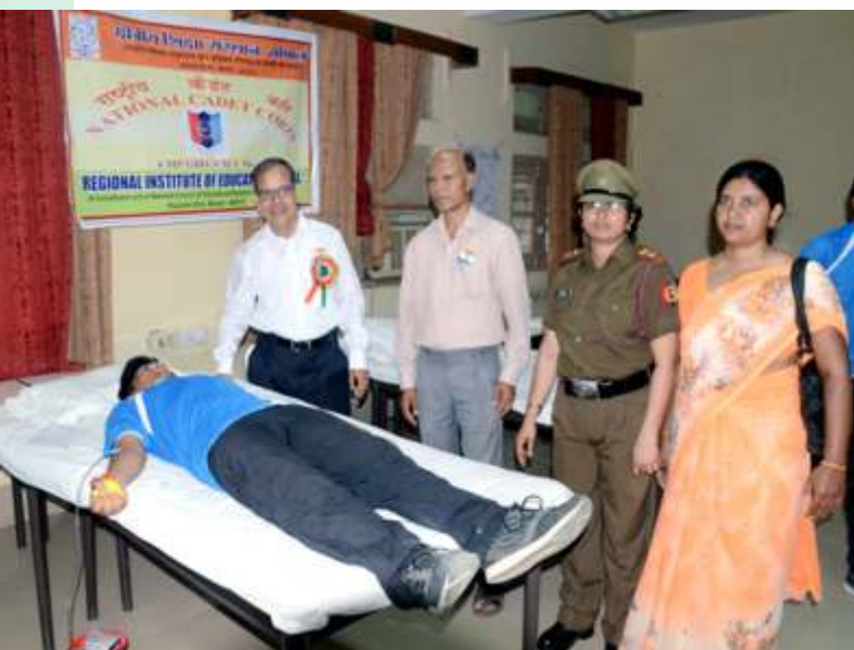
Blood donation camp organized by institute

Tree plantation drive was also organized in the campus where more than 50 trees were planted to mark the Independence Day. Blood donation camp was also organized.