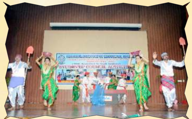
Students performing different activities under the Student Council Activities