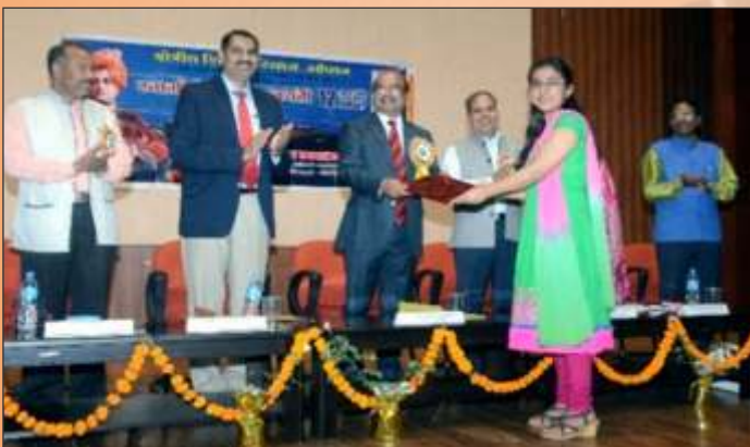
Prize Distribution by the Chief Guest