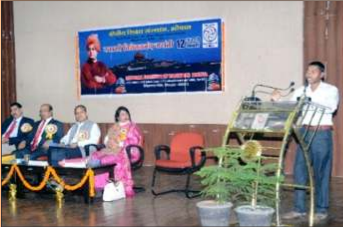
Poem Recitation competition by Students