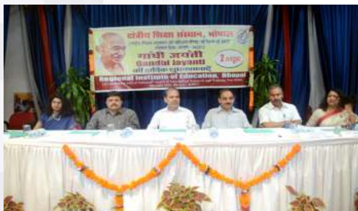
RIE faculty members on the dais