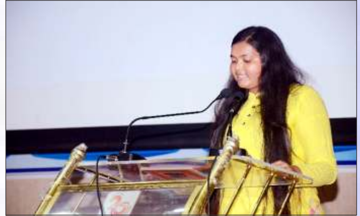
Students participating in Poem Recitation Competition