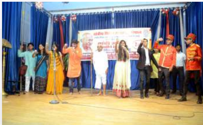
Skit on the life of Gandhiji by the students