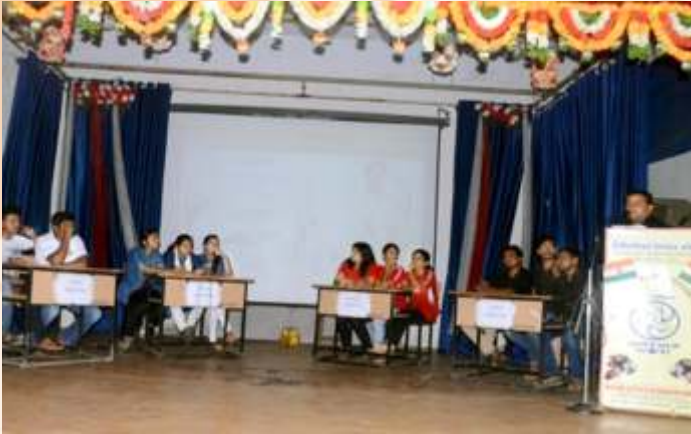
Inter-hostel quiz-contest based on sports GK