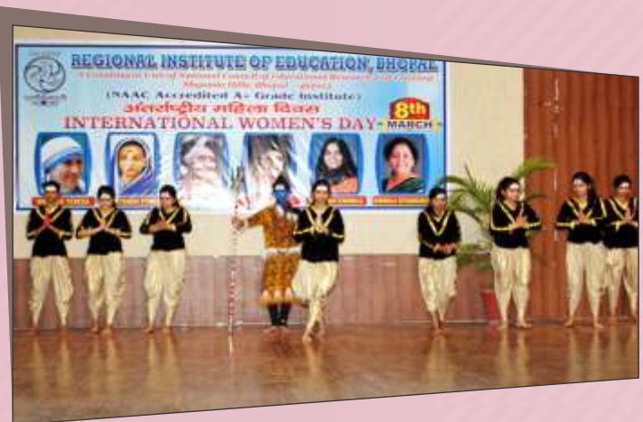
Students Performing Cultural Activities