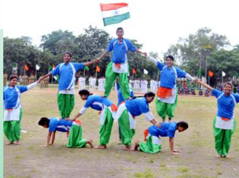
Cultural programs performed by the students of RIE and DM School