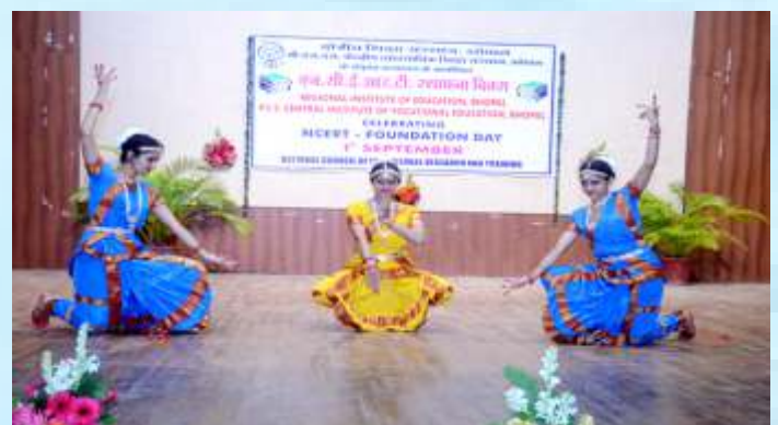
Students performing a cultural programme