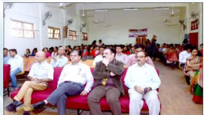
RIE and PSSCIVE Faculty Members in RIE Auditorium