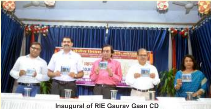
Inaugural of RIE Gaurav Gaan CD