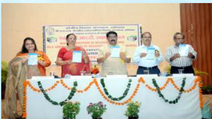
Releasing of a Health card