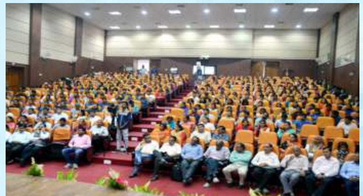
Faculty and students in the Auditorium