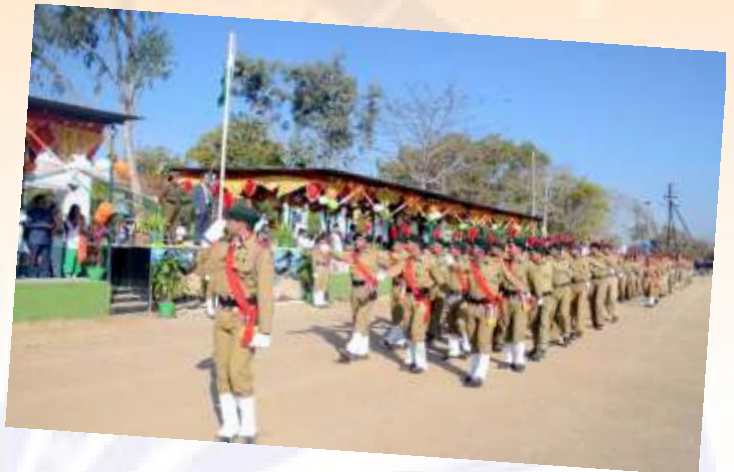
NSS and NCC students performing parade in the ground

The Regional Institute of Education celebrated the Republic Day in the Institute ground with zeal and enthusiasm.