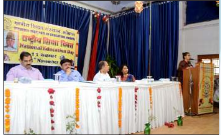
Poem Recitation by Student