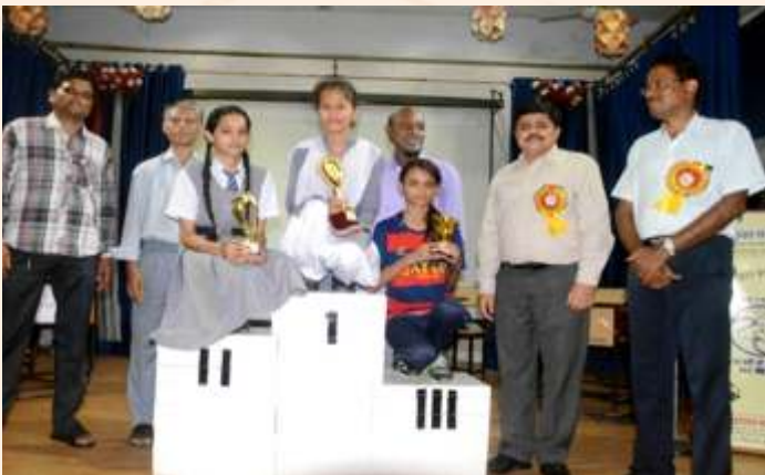
Prize Distribution Awarded by RIE' Faculty