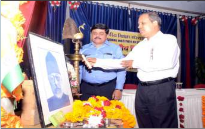
Lighting of Lamp by the Principal, RIE, Bhopal