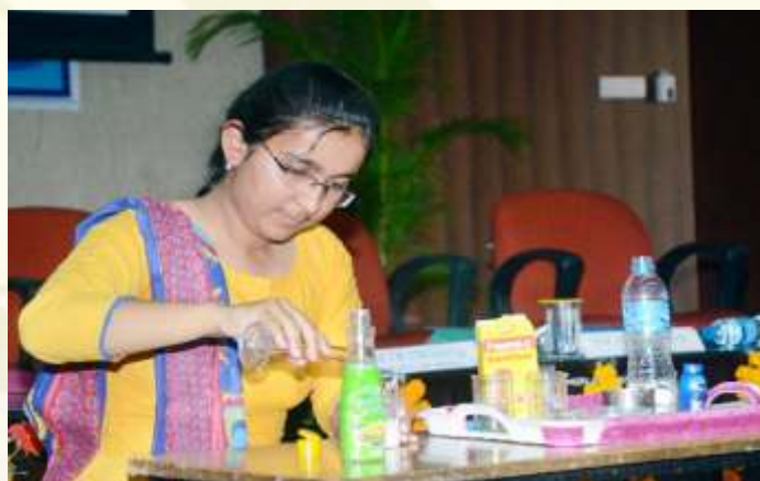
Students Performing a Scientific Activities