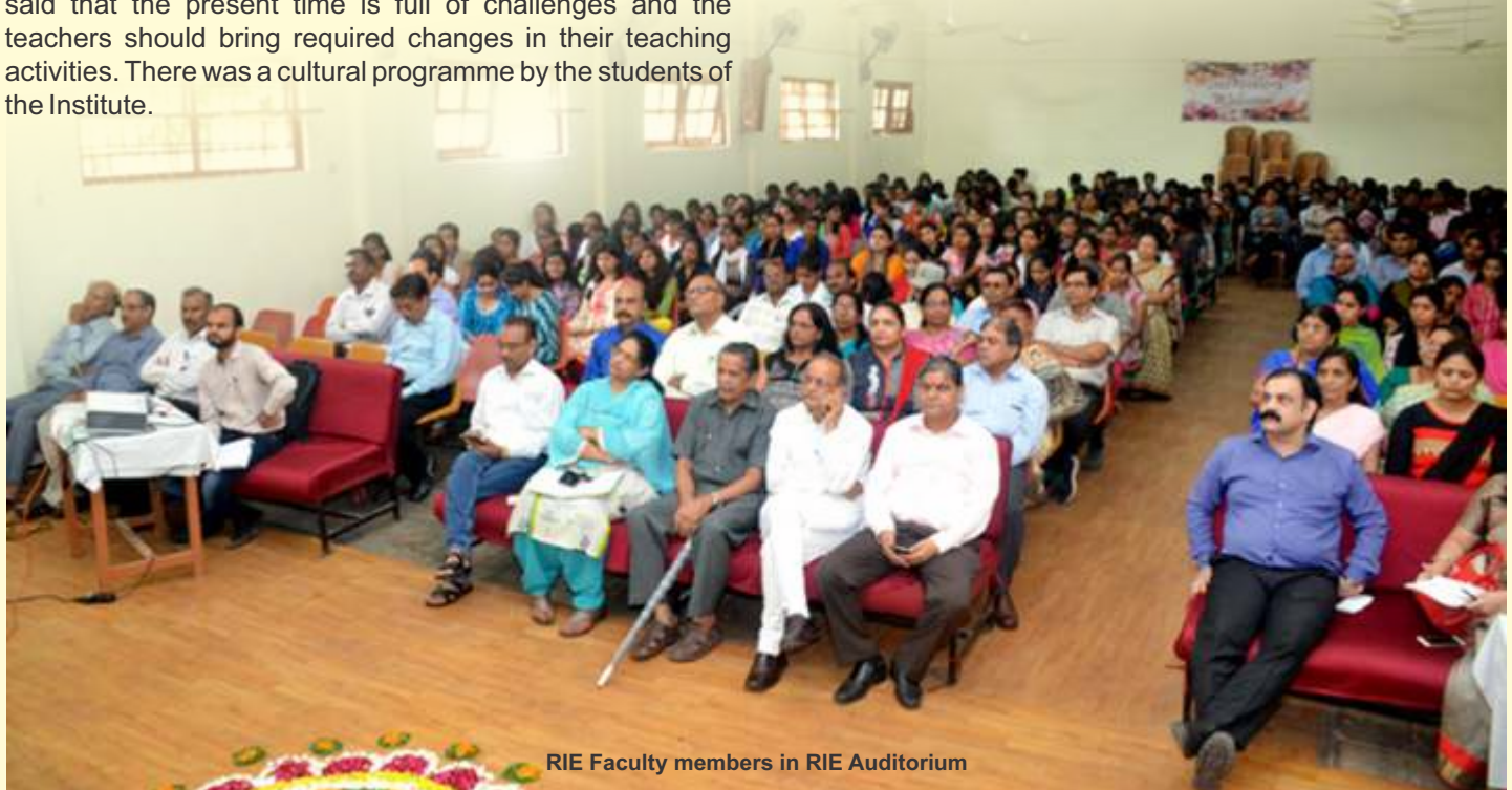
RIE Faculty members in RIE Auditorium