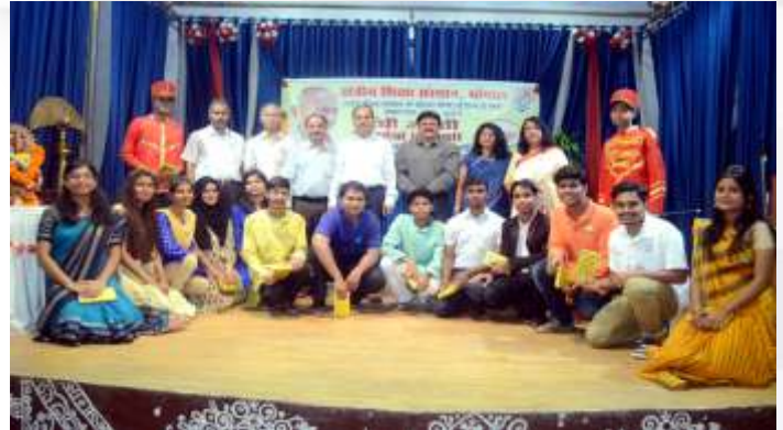
Skit on the life of Gandhiji by the students