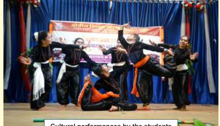
Cultural performances by the students