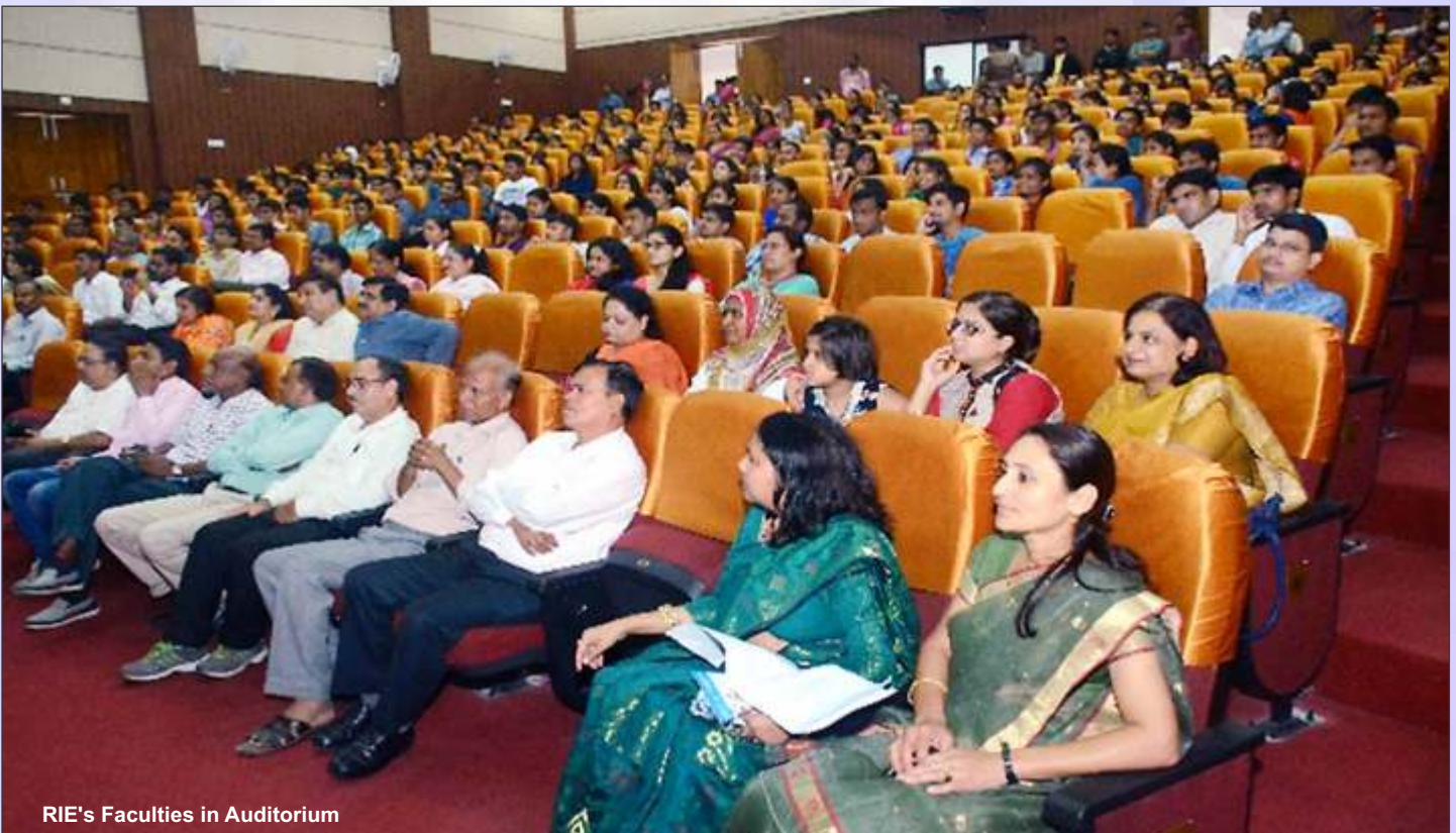
RIE's Faculties in Auditorium