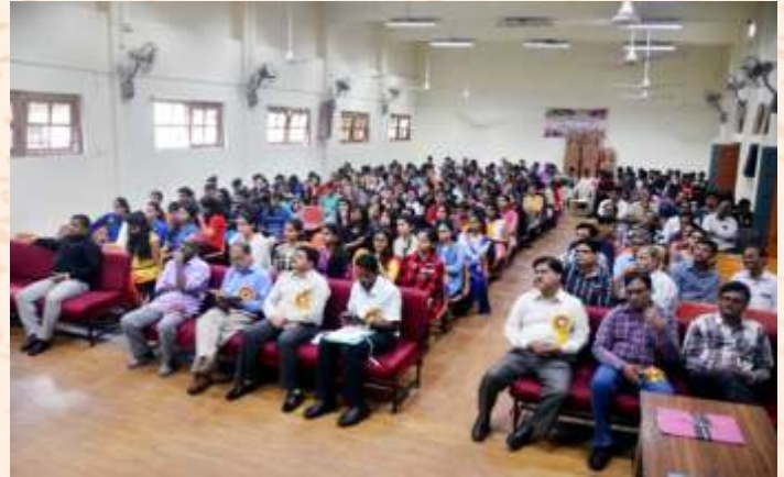
Faculties in Auditorium