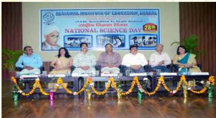
The chief guest and RIE faculty

and achievements of the great physicist.