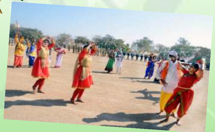
Students performing cultural activities